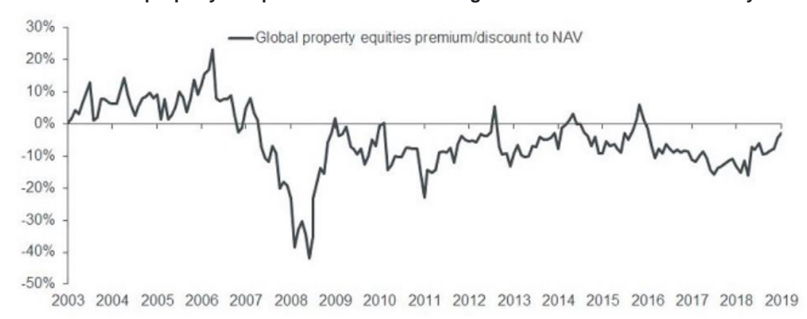
Chart 2: Global property companies have been trading at discounts to NAV in recent years

Comparing the valuations of public to private real estate markets (see chart 2), the discount to net asset value (NAV) has narrowed over the year and now looks to be largely in line with private markets. This is broadly in the middle of what we consider to be the 'fair value' range and suggests that returns from here will come from income and growth rather than re-pricing.