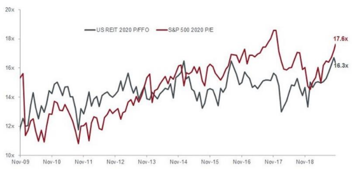
Chart 3: REITs appear to be fairly valued versus general equities

If we focus on earnings multiples in the US, even after US REITs have returned more than 25% year to date<sup>4</sup>, the multiple is still lower than that of the S&P500 Index today and back to a similar level as the US REIT index was five years ago, implying the sector is not expensive (see chart 3).